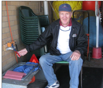
The Old Alan Duncan - pushing buttons